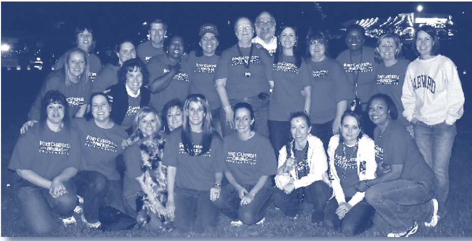
Fort Campbell FCU Relay for Life Team.