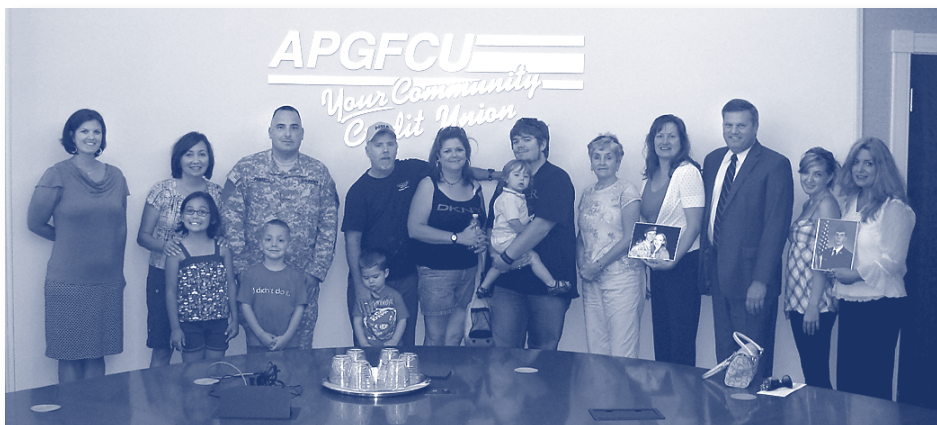
APGFCU's "Spotlight a Soldier" Contest Winners.