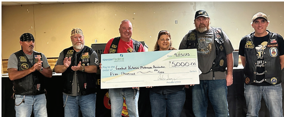
Keesler FCU donated $5,000 to the Combat Veterans Motorcycle Association in September.

Additionally, Credit Union West employees expressed an overwhelming interest in matching the foundation's donation after seeing the devastation in Maui. Employees approved a matching donation of $2,500 earlier this month from the EmployeesCARE Program, a charitable initiative led solely by Credit Union West employees. The voluntary program allows employees to contribute to a single group fund that increases their giving power and helps to make a larger impact. Employees vote each year to designate where their funds will go. EmployeesCARE donations are typically given once per quarter.