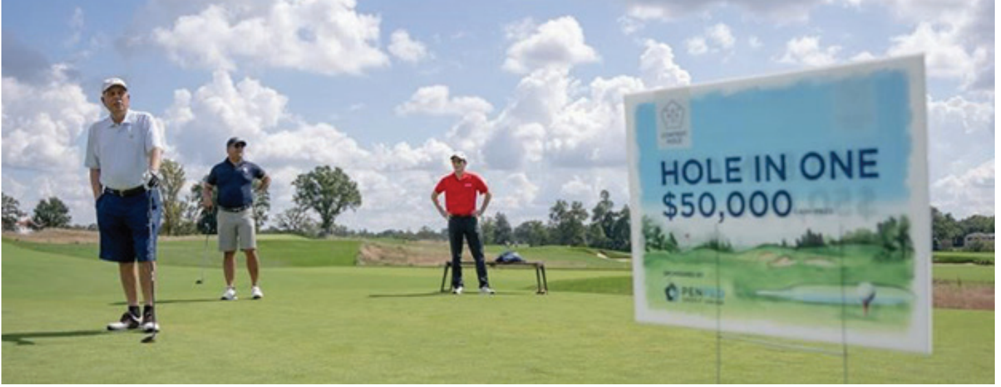
The PenFed Foundation raised nearly $1 million to support veterans and the military community at the 20th annual Military Heroes Golf Classic on Monday, September 1.