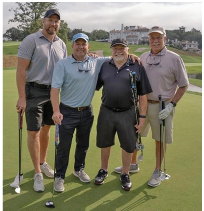
Those who were impacted by and responded to the terrorist attacks of 9/11 were honored during the event.

The PenFed Foundation’s Afghan Allies program has helped 50 families and over 180 refugees resettle in the United States since the fall of Kabul, Afghanistan. The program was founded in November 2021 to assist refugees who are proven to have supported our nation’s values in exemplary ways, with a particular focus on resettling Afghan women soldiers and their families who worked alongside U.S. Army women soldiers through the Army’s Cultural Support Team.