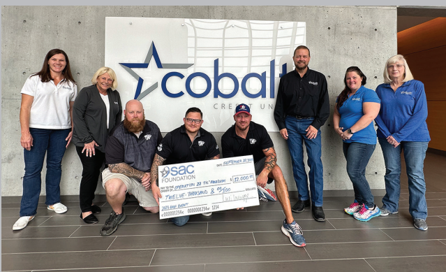
Cobalt CU's SAC Foundation presents a donation to Operation 22 Til' Freedom.

The credit union drive collected enough supplies to support nine schools throughout the greater metropolitan Washington D.C. area. Credit union employees personally delivered the supplies to each school. Credit union members and employees also collected school supplies at the credit union's New Jersey branches and its three overseas military installations.