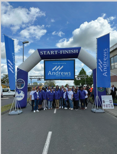
Andrews FCU was the premier sponsor of the Credit Union Freedom Run at USAG Wiesbaden.

Schools representing the winning teachers are Ocean Springs High School; West Elementary; North Bay Elementary School; North Gulfport Elementary; Spann Elementary; North Bay Elemental School; Ridgeland High School; McLaurin Elementary; West Harrison Middle School; Green Elementary; Eastlawn Elementary; John Ehret High School; WC Griggs Elementary; Van Winkle Elementary; College and Career Technical Institute; and Woolmarket Elementary. River Oaks Elementary, Central Elementary, Lizana Elementary, Biloxi High School, Long Beach High School, JPS-Tougaloo, Green Park Elementary.