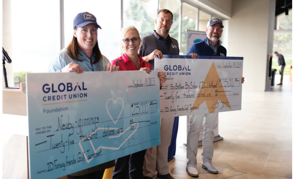
Global CU Foundation volunteers present $25,000 to Newby-ginnings and $25,000 to Big Brother Big Sisters Inland Northwest.