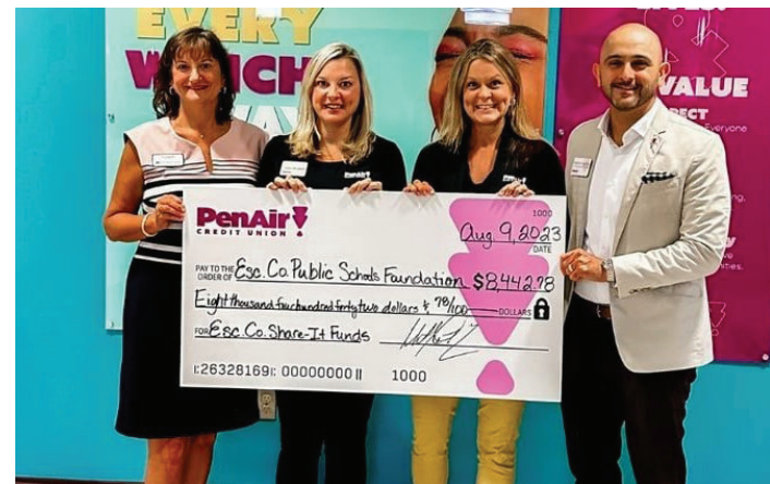
PenAir CU Escambia County schools donations.