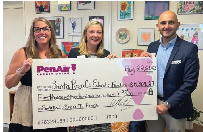
PenAir CU Santa Rosa County schools donations.