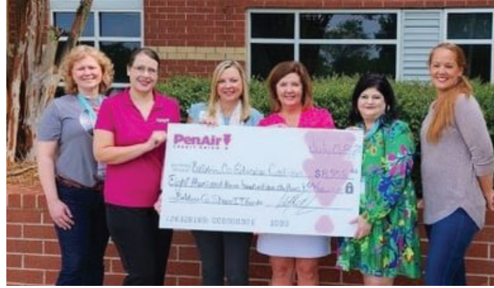
PenAir CU Baldwin County school donations.