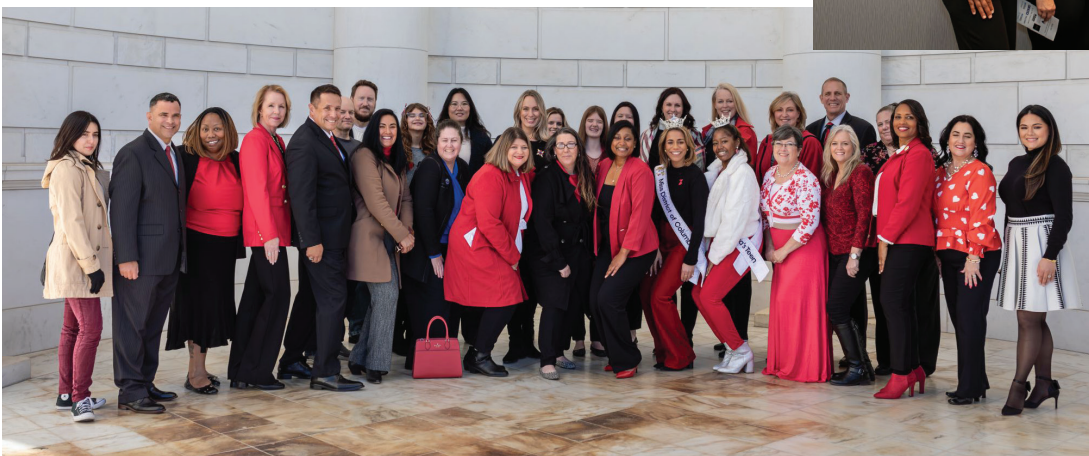
Photography by Trish Alegre-Smith, 2024