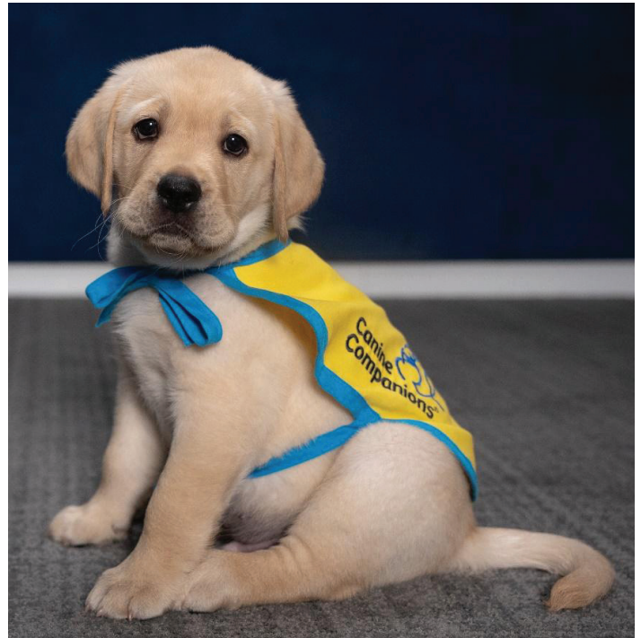
Canine Companions' Pilot is being raised at The PenFed Foundation.