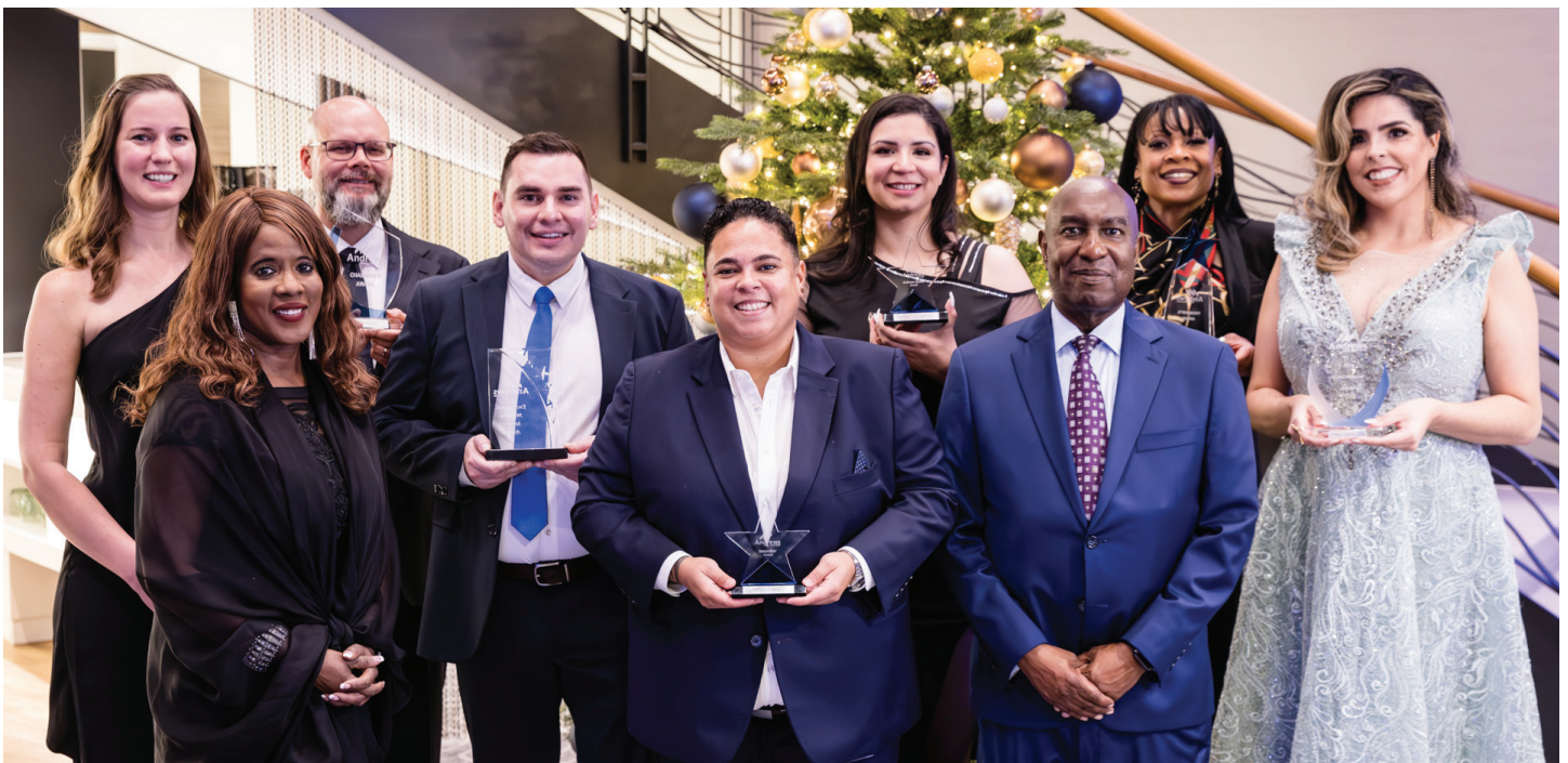
Andrews Federal Gala 2023 award winners

The credit union will also recognize stateside employees for their achievements during a celebratory event in early 2024. ■